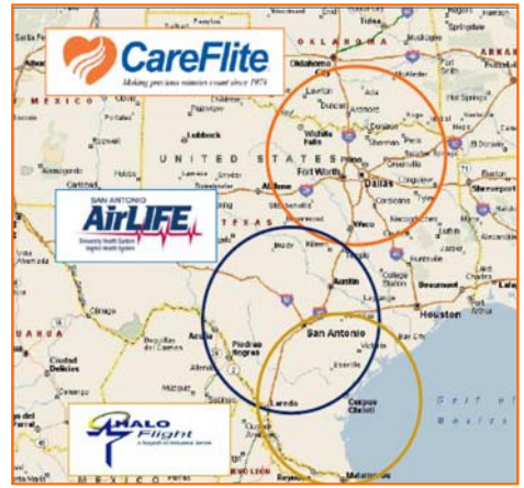
Reciprocal Membership Benefits

CareFlite membership coverage areas shown above plus Ground Ambulance and/or 911 EMS service is currently offered in all or portions of the following counties: Collin, Dallas, Denton, Ellis, Erath, Hill, Hood, Johnson, Palo Pinto, Parker and Tarrant. No service offered to/from Mexico. CareFlite's Membership Program's air benefits are honored by Air Life and Halo Flight in their service areas. Your membership covers any CareFlite ambulance transport regardless of originating location.